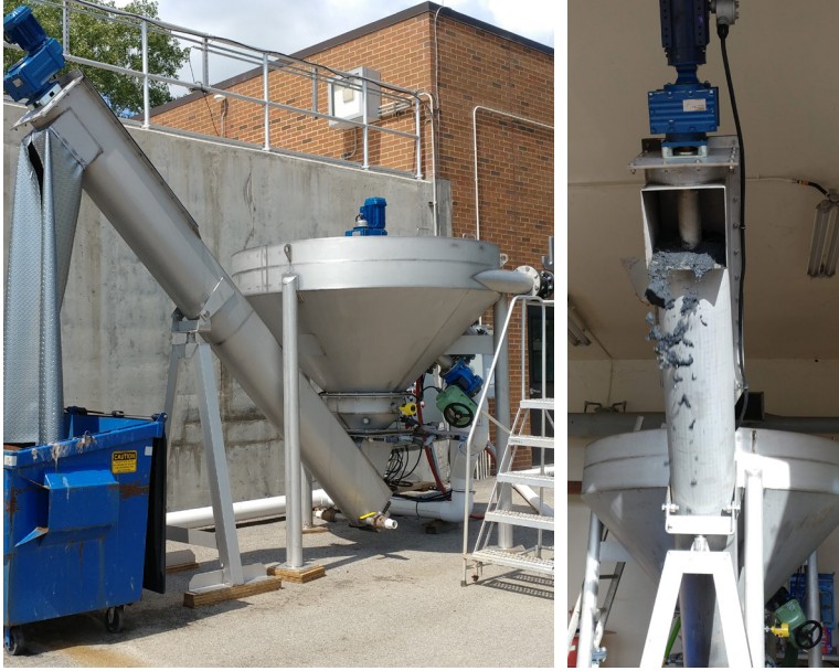
Operating Hydro GritCleanse™ Systems