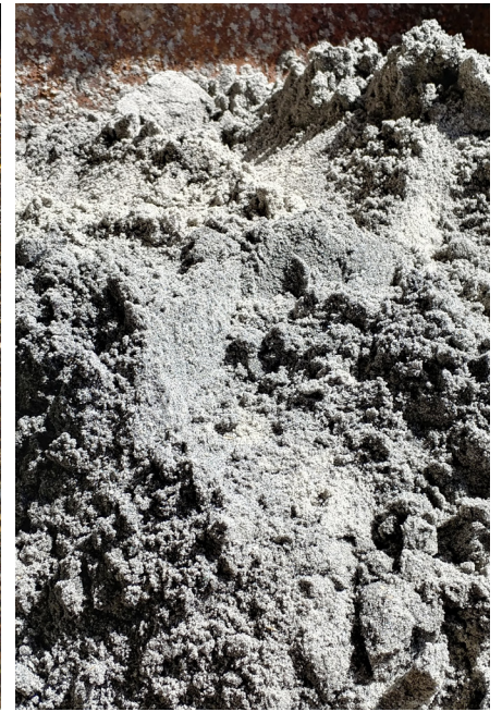
Hydro GritCleanse™ Output <5% VS