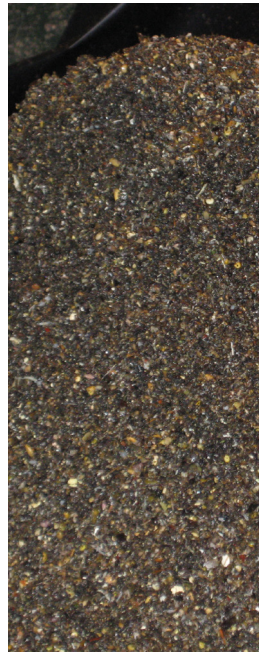
Conventional Grit Washer Output >50% VS